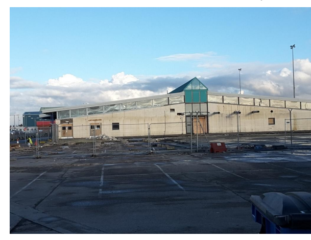
The old terminal ready for demolition ......

From January to March this year our old and obsolete terminal building was demolished and the Administration building moved lock stock and barrel to make way for the new purpose designed college.